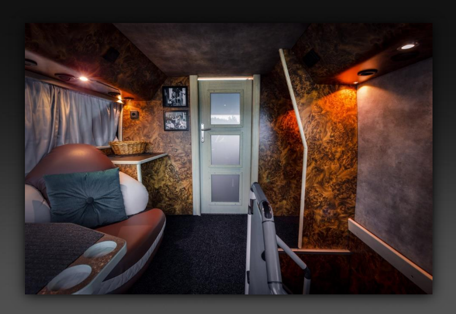
Front lounge upper deck