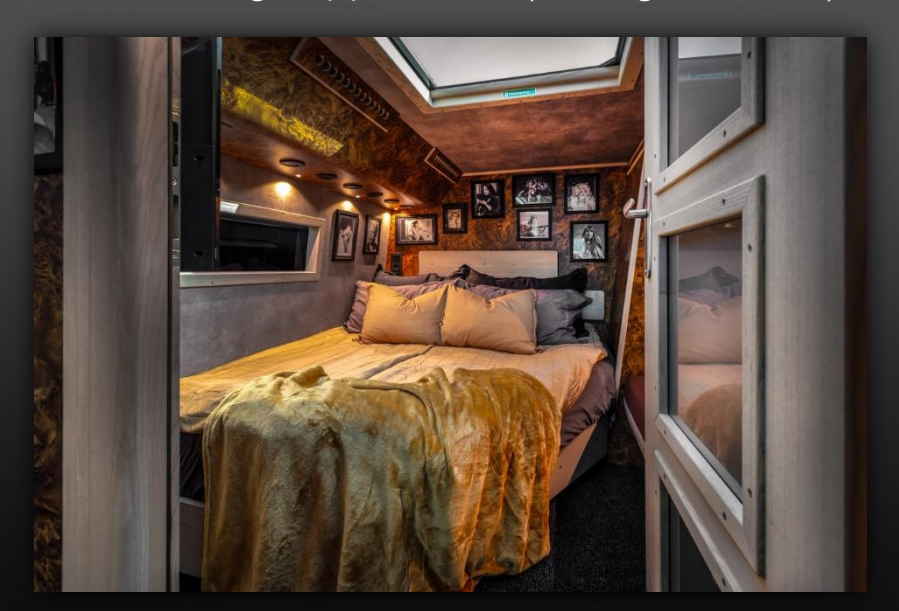
Suite with double bed