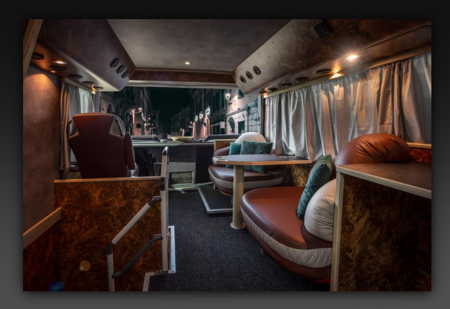
Front lounge upper deck (driving direction)