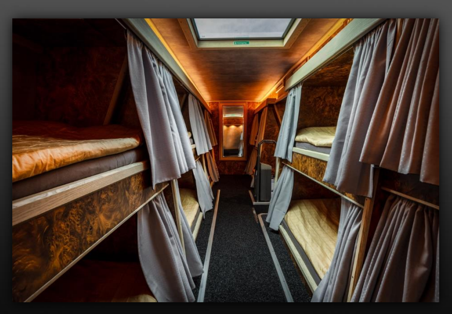
Sleeping area (driving direction)