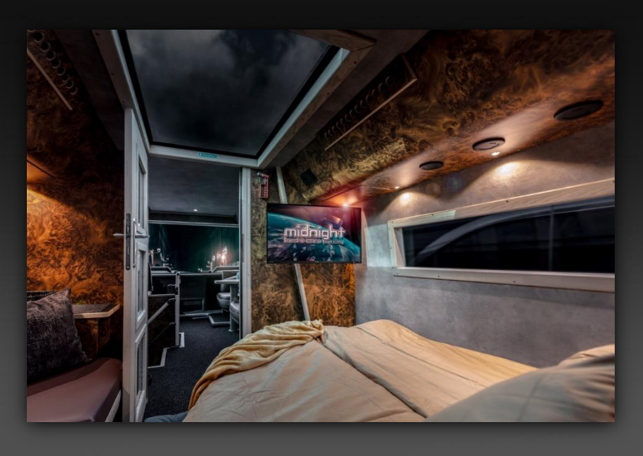
Suite (driving direction)