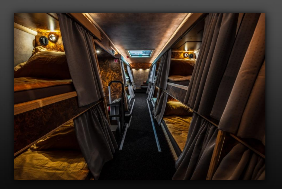
Sleeping area 14 bunks