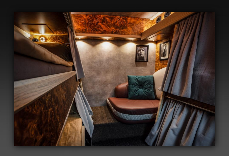
Read a book or hide out