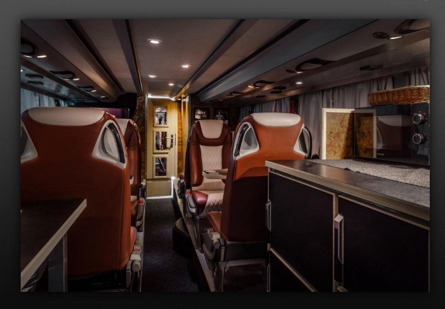
Lounge lower deck (driving direction)