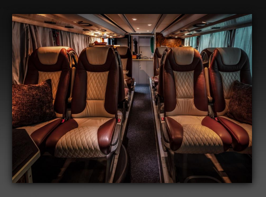
Lounge lower deck