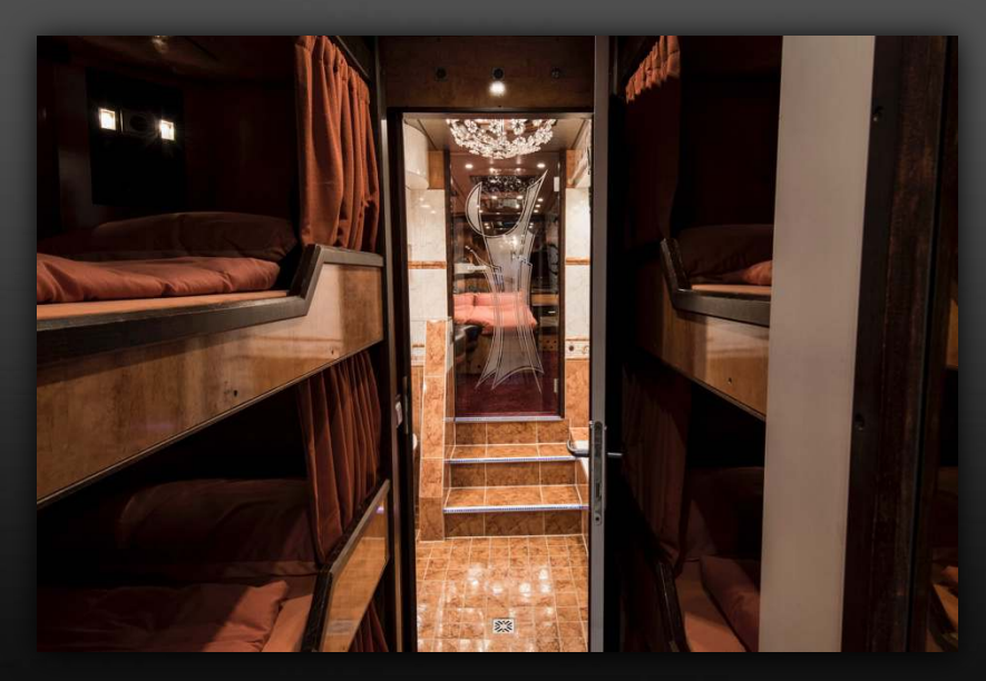
6 berths in passage