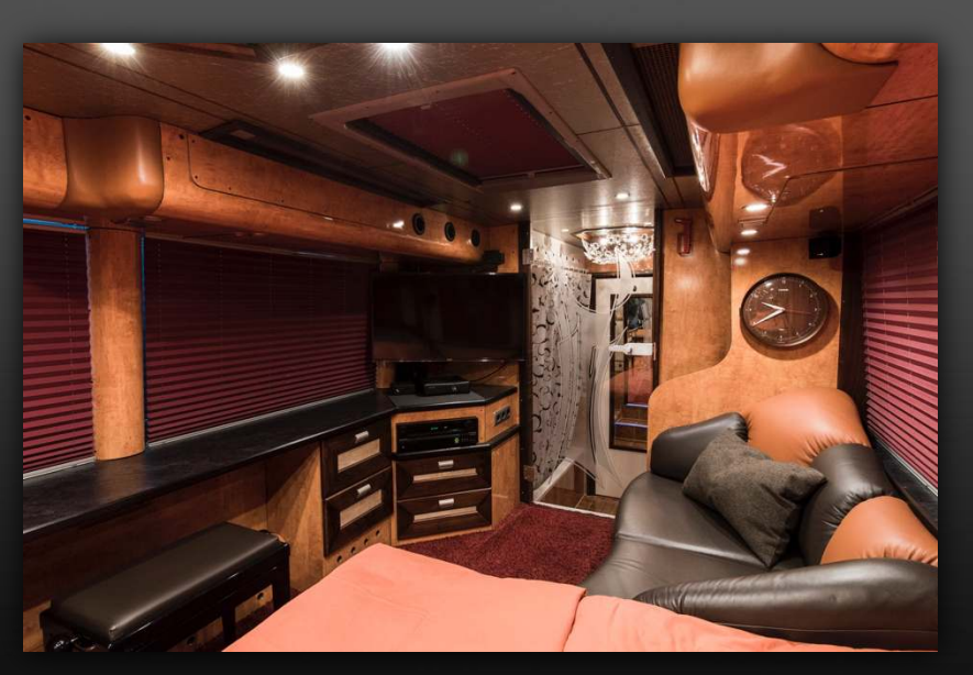
Star room driving direction