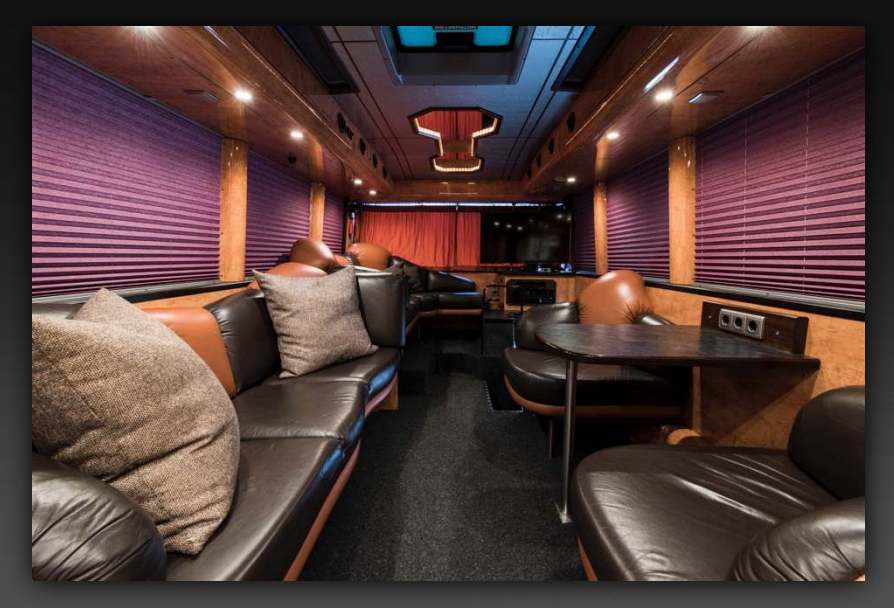
Lounge driving direction