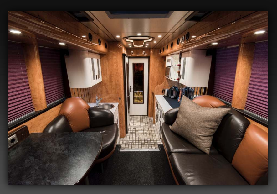
Lounge towards kitchen area