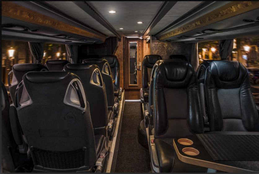
Lounge downstairs (all seats with belts)