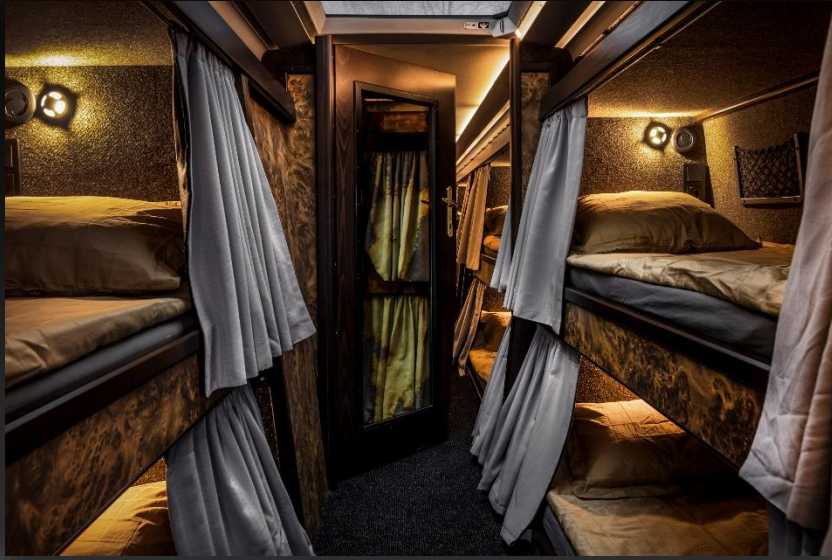
Sleeping area, front