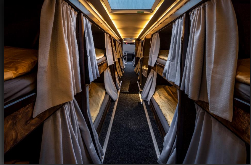
Sleeping area, driving direction