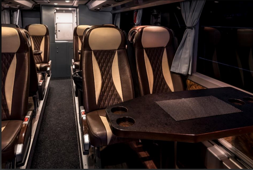
Lounge downstairs (all seats with belts)