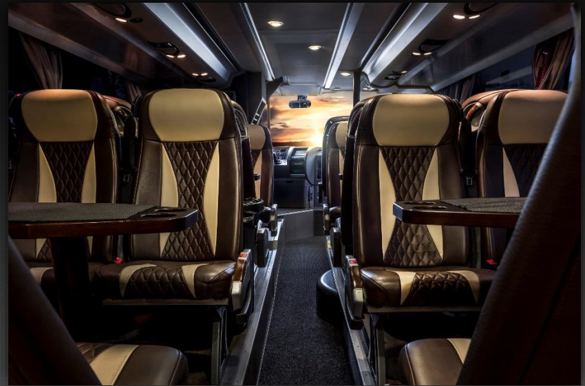
Lounge downstairs (driving direction)