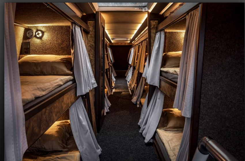
Sleeping area, rear