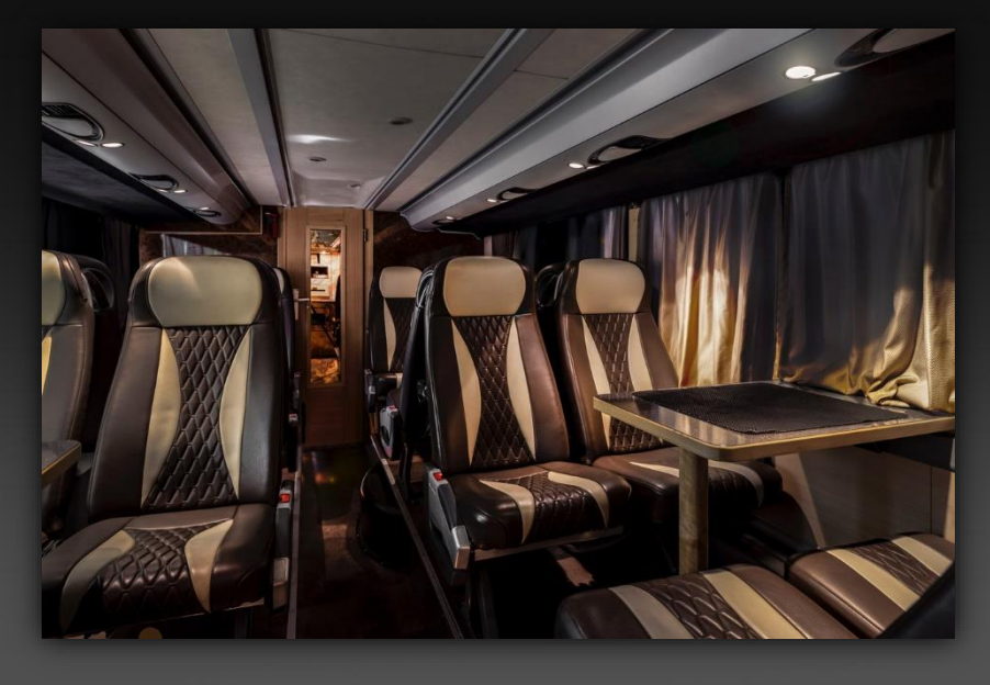
Lounge downstairs (driving direction)