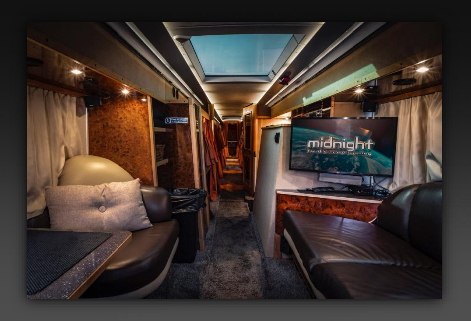
Rear lounge (driving direction)