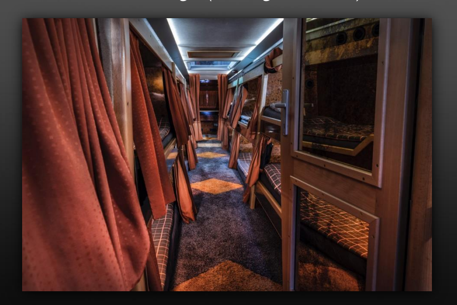
Bunk area (driving direction)