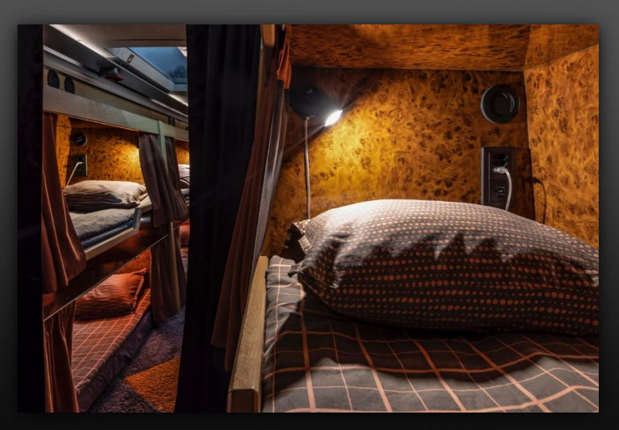
Bunk (230V power & USB charger)