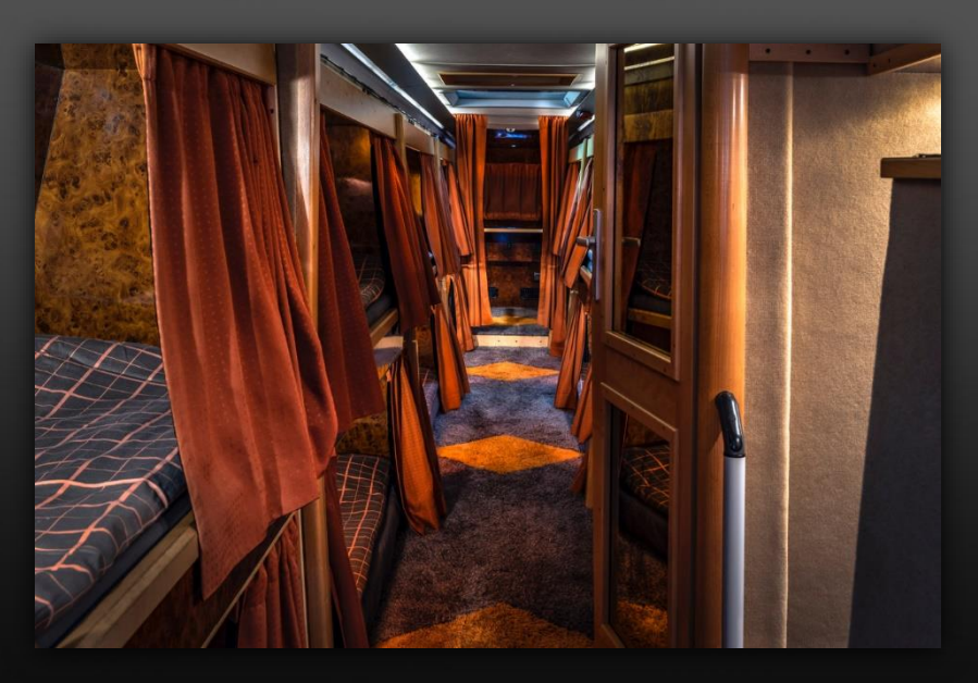
Bunk area (driving direction)