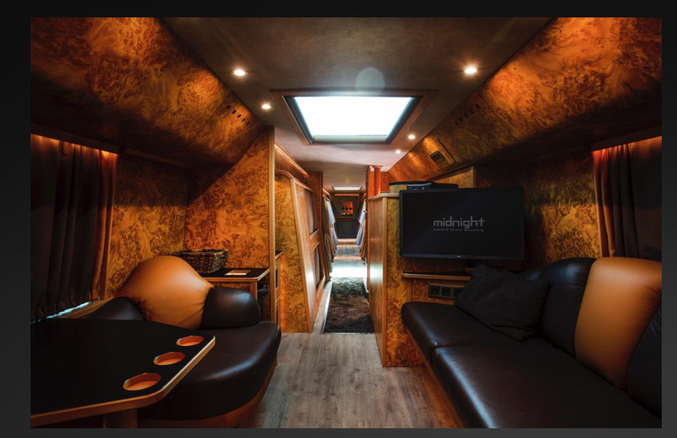
Rear lounge upper deck, driving direction