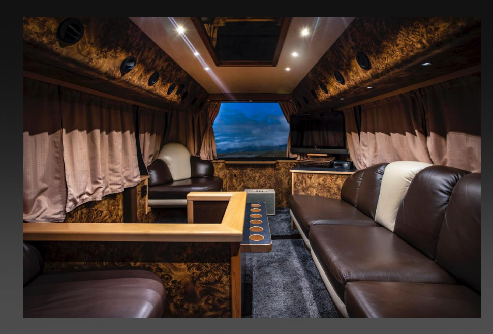
Front lounge upper deck, driving direction