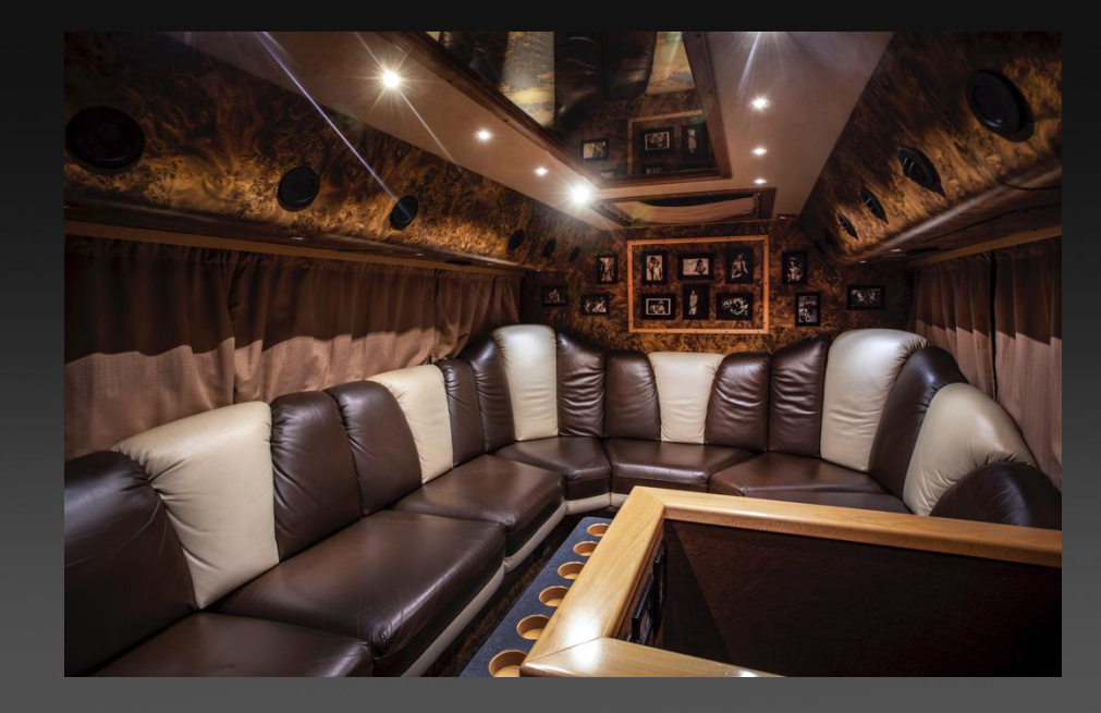
Front lounge upper deck