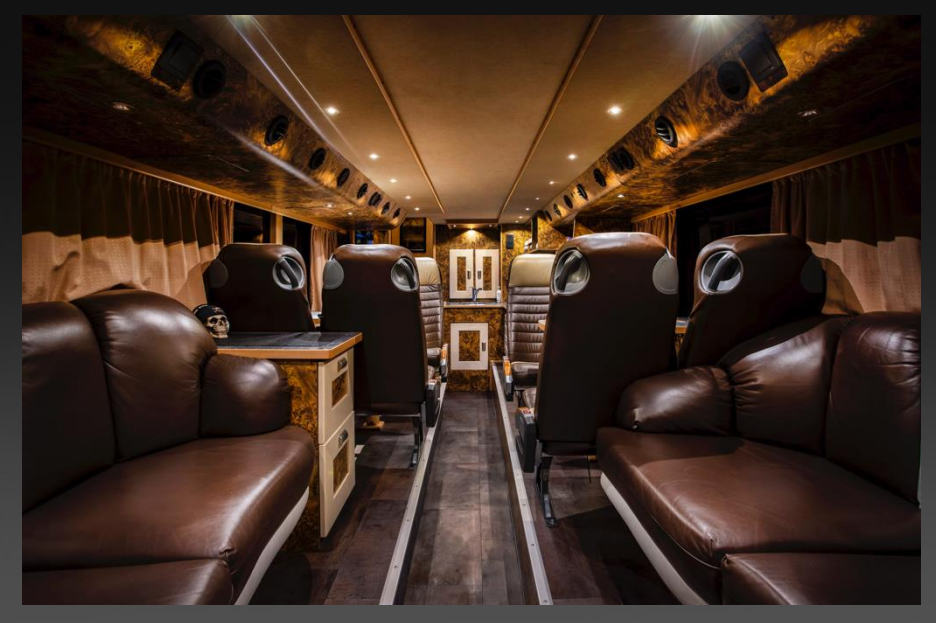
Sofa´s lounge lower deck