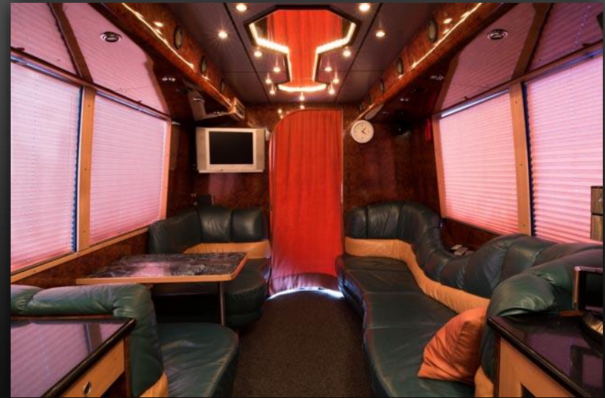
Front lounge (driving direction)