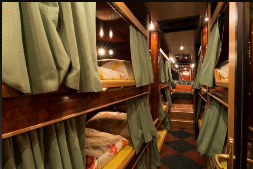
11 berths in passage