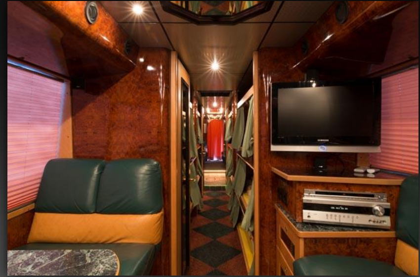
Rear lounge (driving direction)